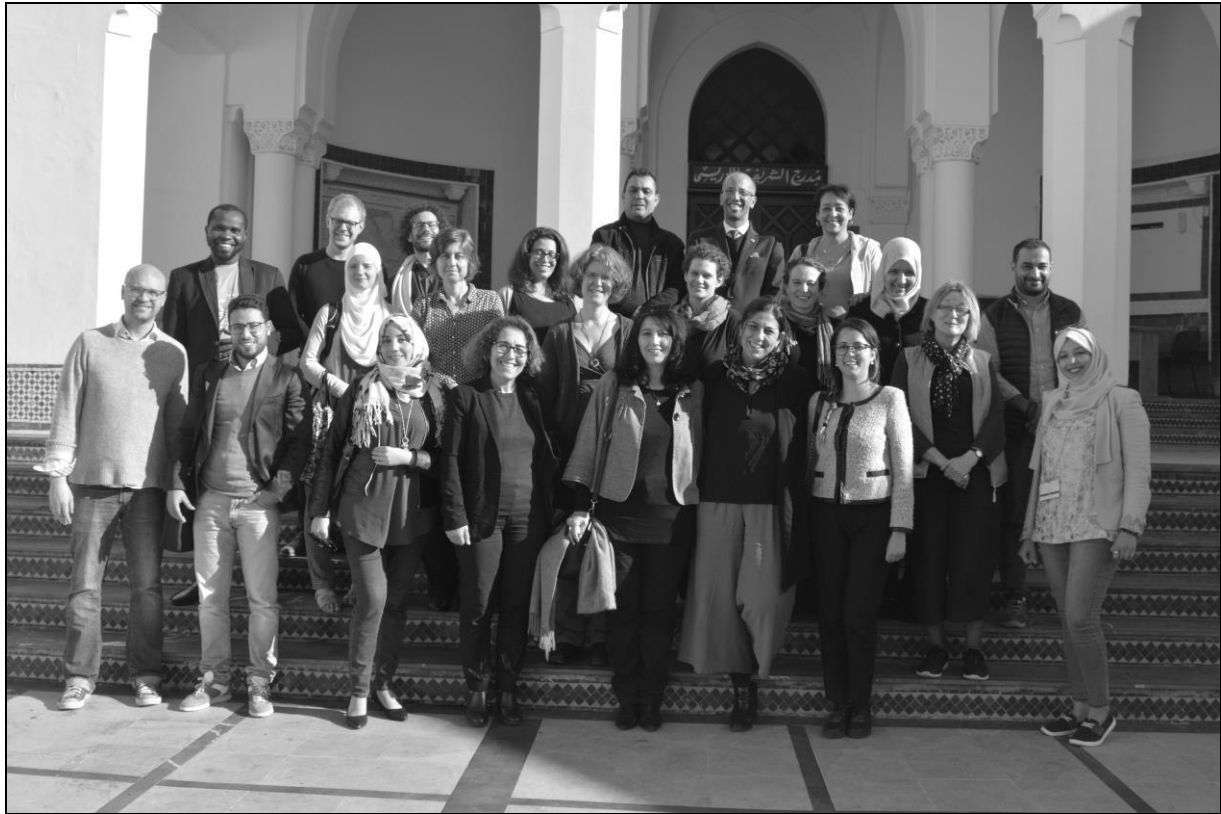
Participants of AGYA Bilingual Summer School in Rabat

The presented research projects of the participants illustrated impressively the versatility and relevance of this perspective in many fields of research; they dealt, for instance, with emotional communities in the Abbasid court society, affective trance in Algerian Sufi rituals, modern kitchen affects in North Africa and concepts of emotion in classical Sufi philosophy.