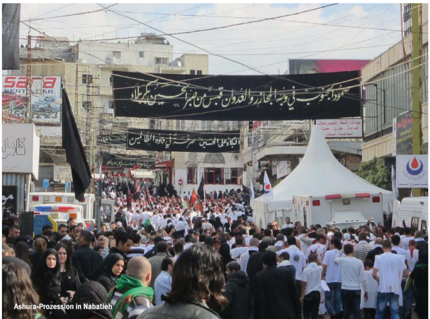
Ashura-Prozession in Nabatieh

➤ 26. DAVO-Kongress: Hamburg, 3.–5. Oktober 2019