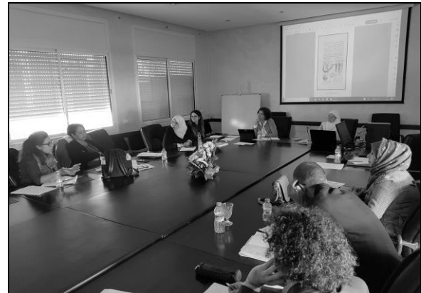
Discussion of Junior Scholars' Research Projects

This year’s summer school addressed the emerging interest in emotion, affect, and body in the field of Arabic literature and culture that goes along with an emotional and affective turn in the humanities. In this regard, the transformations and actions related to the so-called “Arab Spring” have often been explained by analyzing affective intensities, emotional dispositions, and structures of feeling, while in studies of classical Arabic literature and culture concepts of emotion have been addressed from a new theoretical and methodological background.